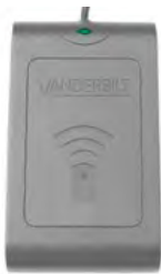
Product ACT-USB USB MIFARE Reader