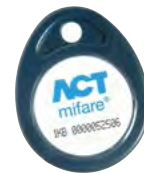
Product MF10T1 MIFARE FOB (pack of 10)