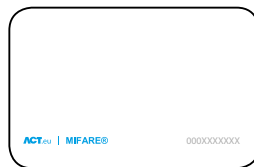
Product MF10C1 MIFARE CARD (pack of 10)