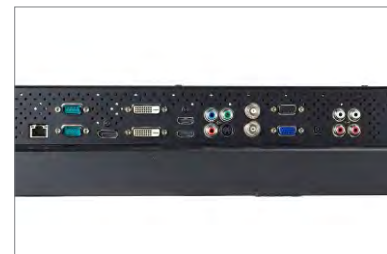
Multiple video inputs (VGA, DVI, HDMI, BNC, S-Video, DisplayPort and Component) allow for effortless system integration