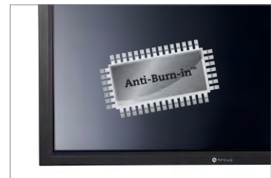
Anti-Burn-in™ technology prevents image sticking