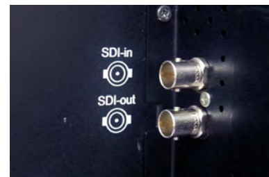
SDI inputs bring forth mega-pixel images without interruption or delay