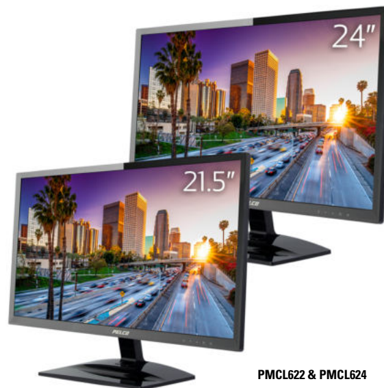
PMCL622 & PMCL624

Pelco's PMCL600 Series monitors combine the latest technologies into a perfect complement to your investment in megapixel imaging and performance. Desktop full high-definition (FHD) monitors deliver 1920 x 1080 resolution and are specifically engineered to exceed the demands of surveillance operators.