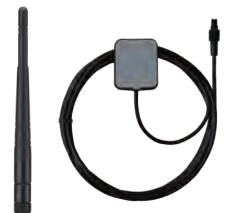
Wi-Fi / GPS antenna