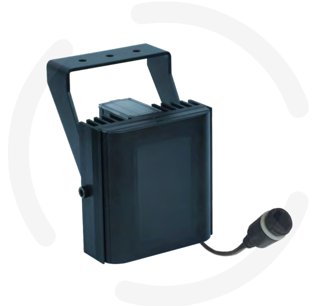
Interchangeable Diffuser Lens