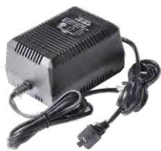
TEAC-66-243000V (EU) MKAC-66-243000U (USA) TEAC-66-243000VB (UK) Power adapter (for outdoor model)