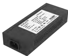
LAS60-57CN-RJ45 Hi-PoE Midspan