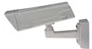
With AXIS T94R01P Conduit Back Box

AXIS T93F Series comes with a wall mount and an integrated sun cap. AXIS T94R01P Conduit Back Box, and AXIS Corridor Format Bracket A are available as optional accessories to increase installation flexibility.