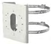
DS-1275ZJ-S-SUS Vertical Pole Mount