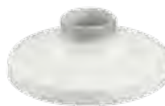
SBP-167HMW / SBP-167HM