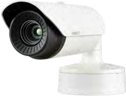
TNO-4030TR / TNO-4040TR