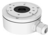
DS-1280ZJ-XS Junction Box