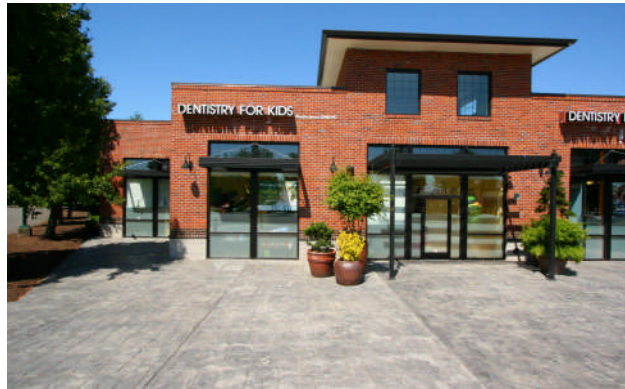
Theia's lens using Linear Optical Technology®