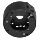
WV-QJB502A-B Mount Bracket