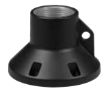
WV-QCL101-B Mount Bracket