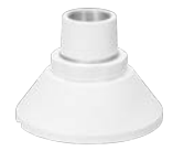
WV-QSR506F-W Mount Bracket