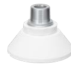
WV-QSR506M1-W Mount Bracket