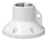
WV-QCL100-W Mount Bracket