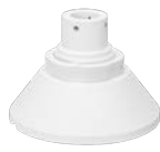
WV-QSR506-W Mount Bracket