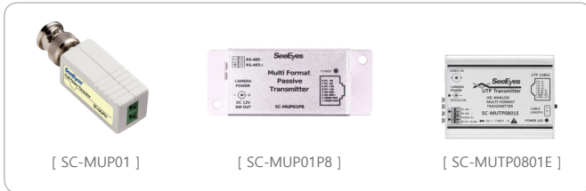
[ SC-MUP01 ]